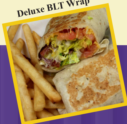
Deluxe BLT Wrap