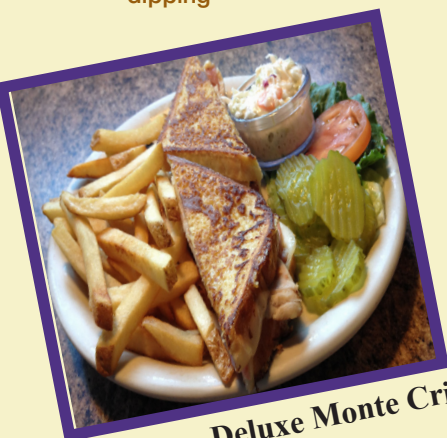
Deluxe Monte Cristo

Buffalo Wrap 8.29, 9.79 Dx Garlic wheat tortilla stuffed with breaded chicken tossed in buffalo sauce with lettuce, tomato, bleu cheese crumbles, & ranch dressing